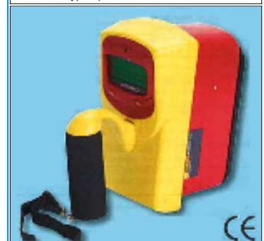
Fig. 3. FLUKE survey meter 451B type can measure radioactive contamination including beta-ray, gamma-ray and X-ray.