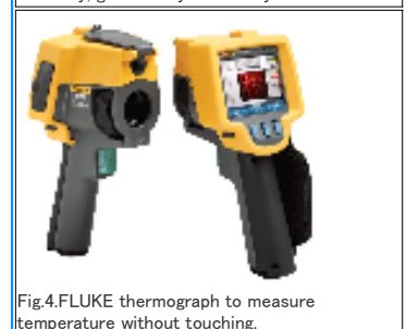
Fig.4. FLUKE thermograph to measure temperature without touching.