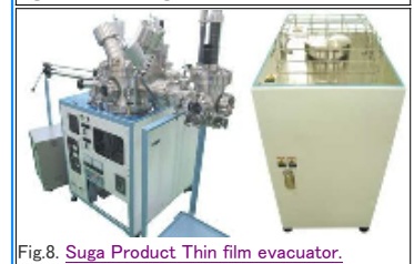
Fig.8. Suga Product Thin film evaporator.