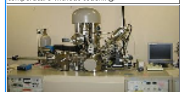
Fig.5. Collaborating with JEOL. "Review PEEM".